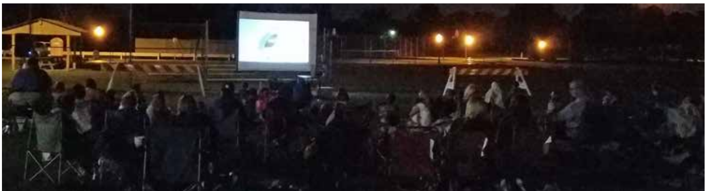
Movie Nights are scheduled for July 14 and August 18 at Chapel Park.

The 2017 softball season is set to start for the girls of Southport Cinderella. This year the organization is celebrating its 10th season at Chapel Park. As of this writing, we are well on our way with sign ups and hope to have numbers very comparable with past seasons. We have five divisions tee-ball, 8u, 10u, 12u, and 16u. This is a developmental program so every skill level is welcome. Our philosophy is fair play and giving everyone an opportunity to get out and play. We hope to see a lot of new faces this year and look forward to another successful season at Chapel Park. Please visit our website at www.southportcinderella.com for more information about our organization.