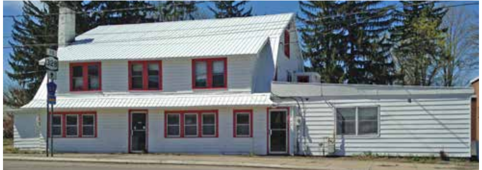
The Town was awarded a grant to assist with the re-development of the Dixie Barbeque site.

You may ask why we are addressing this issue. This is to prepare the Southport taxpayers for the fact that we may have to consider a tax increase in the near future. Please keep in mind that over the last 13 years we have lowered the tax rate from $3.05 per one thousand to .78 cents per one thousand. For example, a Town resident who has a house assessed at $100,000 is now paying $78 per year for the Town tax as compared to $305 13 years ago. This is most likely one of the lowest tax rates in this county and adjoining counties. We did this while building up a fund balance with the intent to build a Community Center Building however, that was voted down. We also did this not foreseeing our sales tax being reduced by the County.