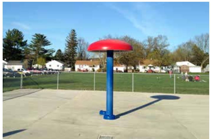
The splash pad at Elmer Goodwin (Universal) Park is scheduled to open on Memorial Day weekend.