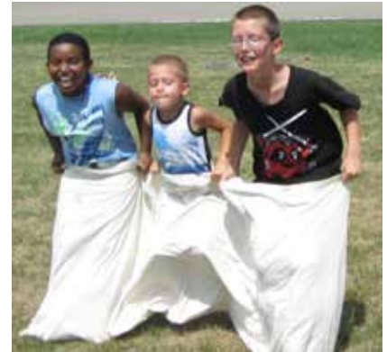
Children enjoy playing a 9-hole golf course, set up by First Tee, and sack races at the Town Summer Parks Program.

The pickleball nets are back up!! This is a growing sport that continues to gain popularity. We have seen people of all ages on the courts. We have some balls and paddles available during normal business hours, so DON'T be shy! Come on down to Chapel Park and try it out. For more information on pickleball visit www.usapa.org