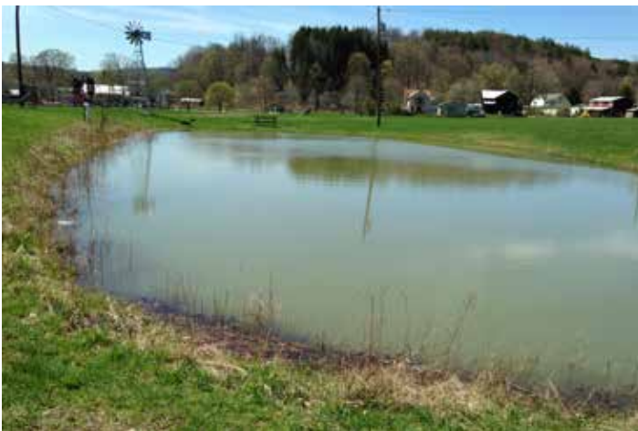
The Draxler Park pond is stocked and the fish are biting.

I hope this information explains a little about what we do and what training we go through. As always if you have any questions or need our assistance, don’t hesitate to contact us during normal business hours.